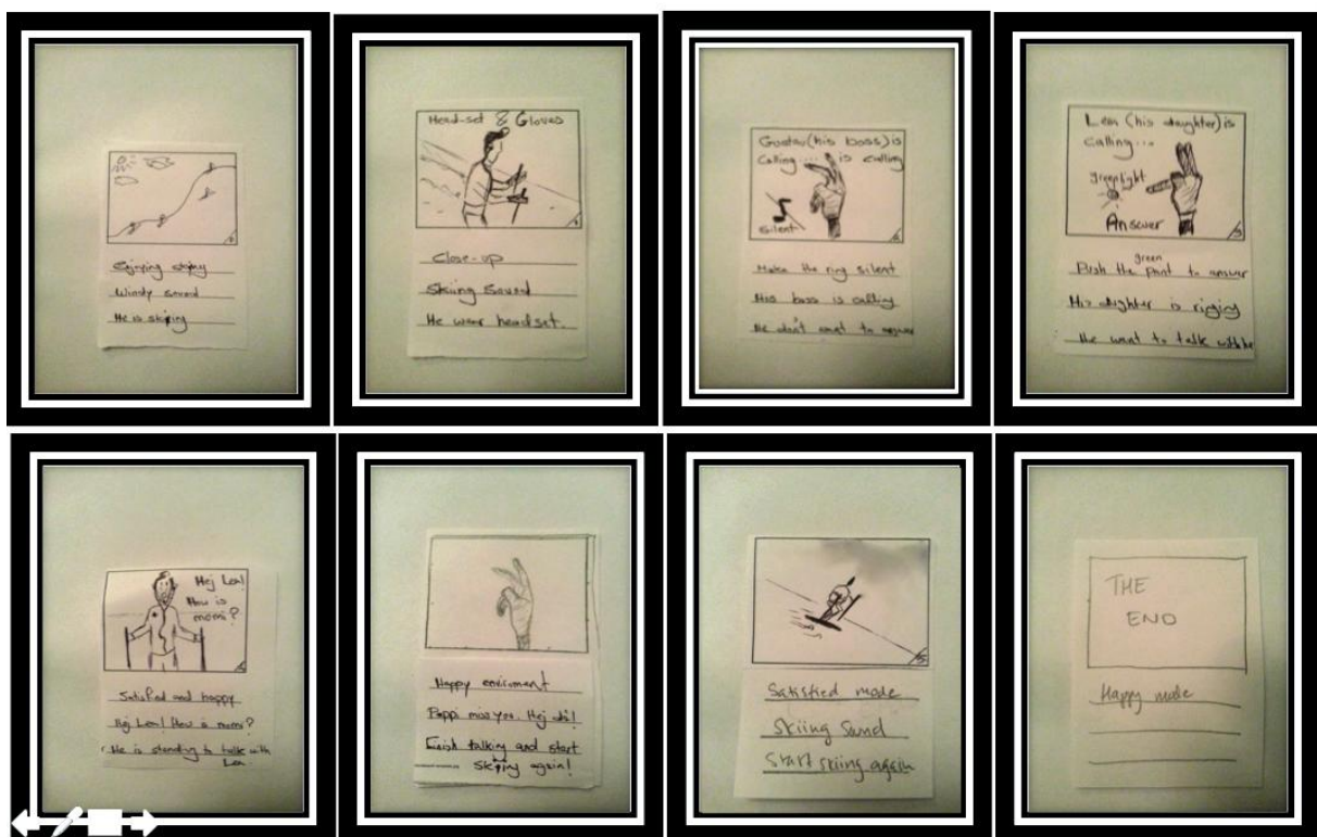
Figure2: Last Version of TeleGlove Storyboard