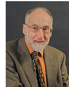
Robin Milner (1934 - 2010)