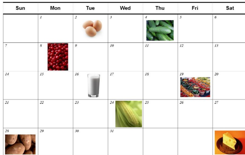
Figure 3: Possible calendar page layout.

The calendar shall be a visual representation of one month, with clickable images of the month's dishes. These images shall be links to corresponding recipes. Your calendar shall have dishes two days in the month, the meatballs day and the pancake day. The calendar might, but is not required to, look like Figure 3.