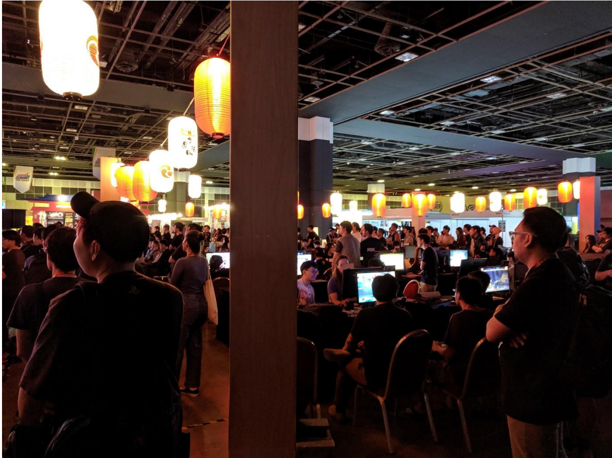
Figure 6 The venue of the E-sports tournament South East Asian Major, Singapore