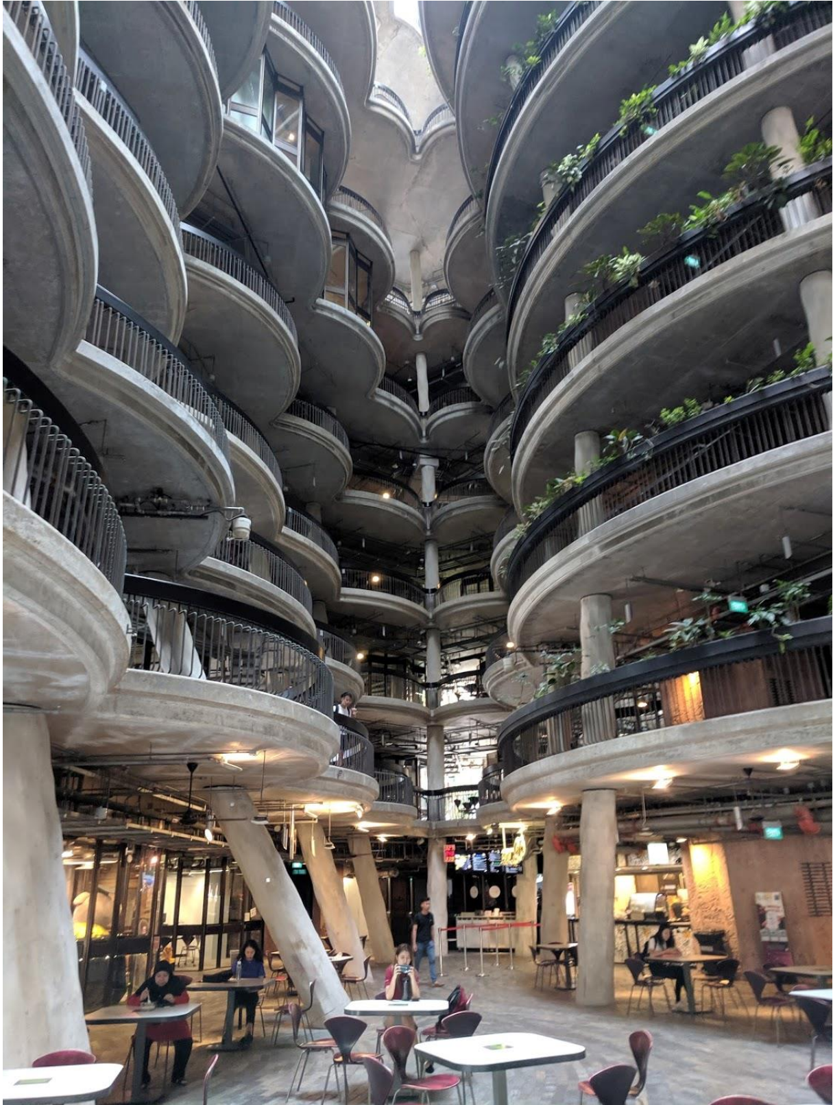
Figure 2 The inside of the Hive at NTU campus