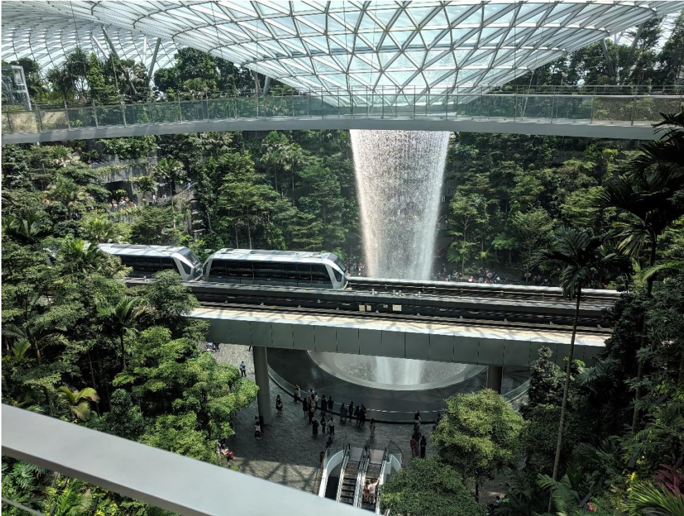
Figure 3 The inside of the Changi International Airport