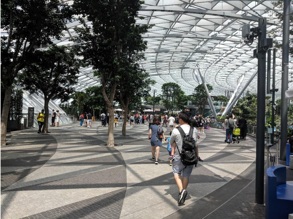
Figure 4 The treetop walk at the Changi International Airport