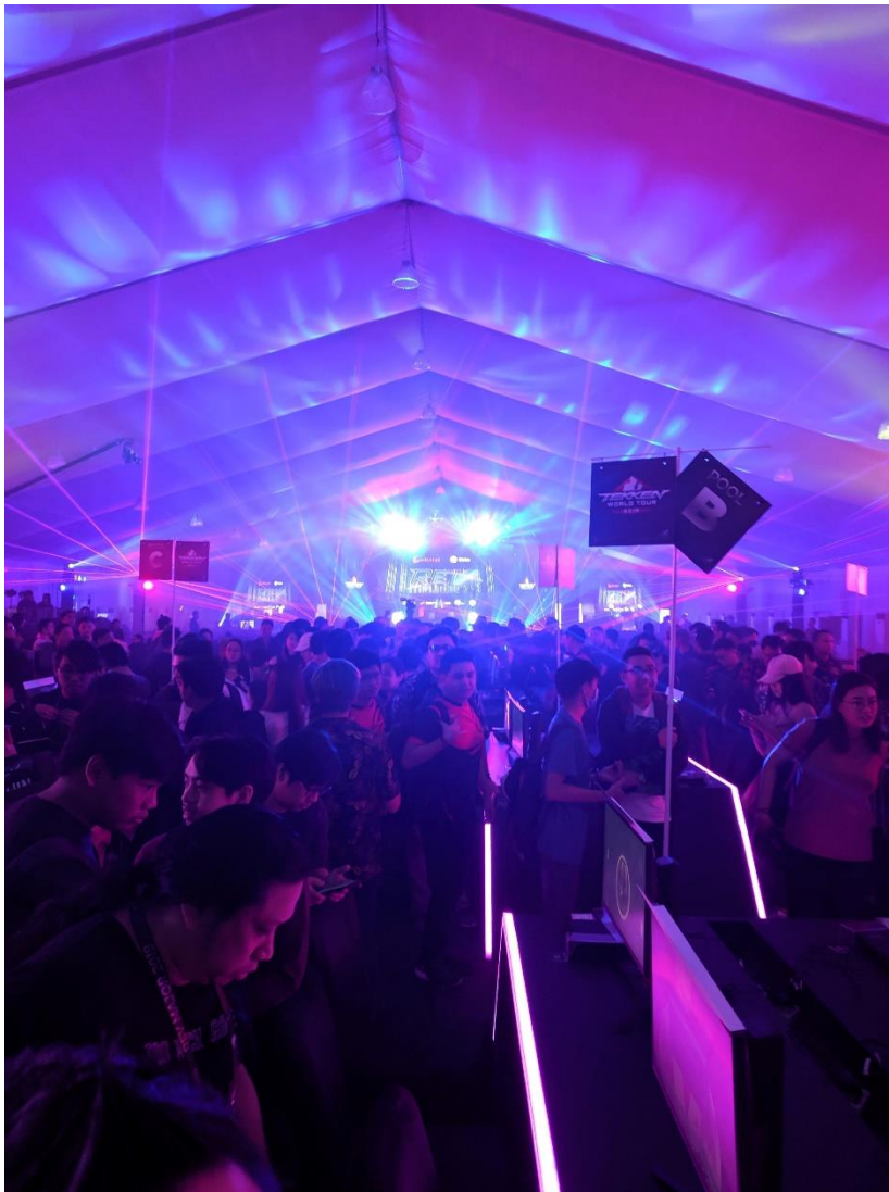
Figure 5 The Venue of the E-sports tournament Rev Major 2019, Manila, Philippines