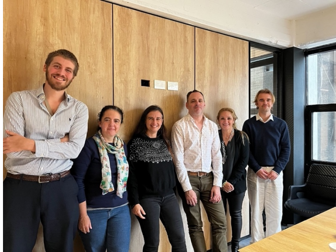
This picture is from our final meeting with the international group.

AySA has a program for foreign students and we were placed with the international group that works with contact with other countries and foreign contacts. It was very gratifying to work at AySA as a student, we had a person in our team who acted as a mixture of assistant and mentor to us and spent about 20 hours of his work week, every week, helping and supporting us. Everywhere we went within the company we were met by people who wanted to help us and understand why we were there, which made it much easier as a large part of our work was to interview employees. When we left, our contact persons said that they would be happy to receive more students from Sweden and KTH, and we can really recommend it!