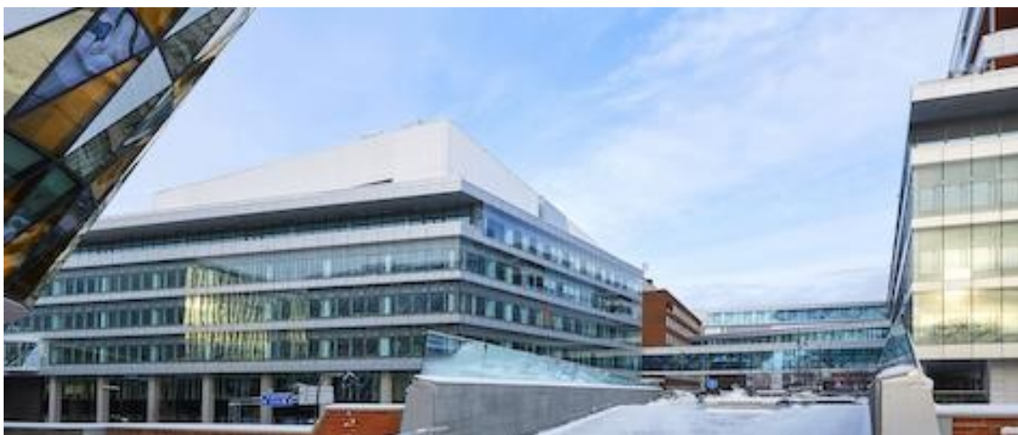
MedTechLabs facilities in BioClinicum, Karolinska University hospital