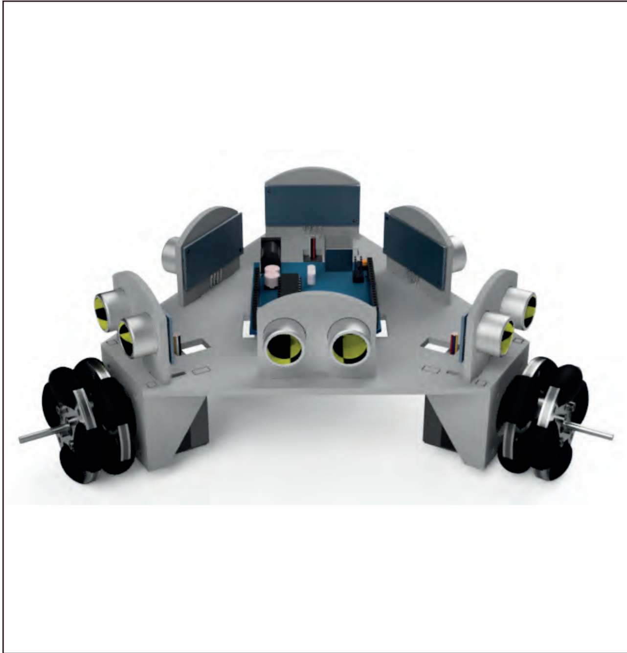
CAD render of the robot