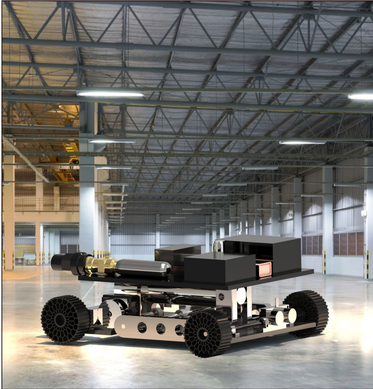
CAD render of the robot.

A robot car that can launch itself over obstacles